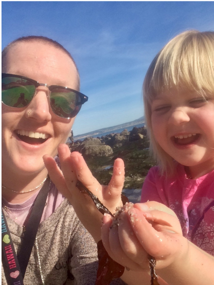
Healing Touch helps participants be more present for themselves and their families.