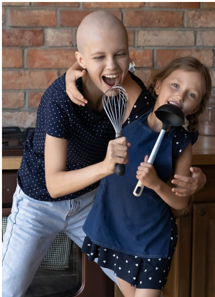
Healing Touch helps recipients be more present for themselves and their families.

Current research shows how powerful the mind body connection is in supporting healing. HPCC promotes integrative healing and self-care by offering 8 free Healing Touch (HT) sessions (1 session/week for 8 weeks) to cancer patients either in person or remotely. HPCC collaborates with individual oncologists to integrate with the patient's treatment plan. HPCC's HT recipients report an increase in their strength and resilience, a reduction in their stress, fatigue, anxiety, and pain. Recipients are also given resources to continue their own self-care at the conclusion of their HT sessions.